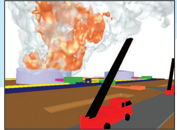
Storage Tank Fire

Clients who have private, in-house CFD programs are still able to benefit from CSE's experience. In conjunction with these commercial and in-house packages, CSE has developed its own in-house tools to provide faster and more detailed results and solutions.